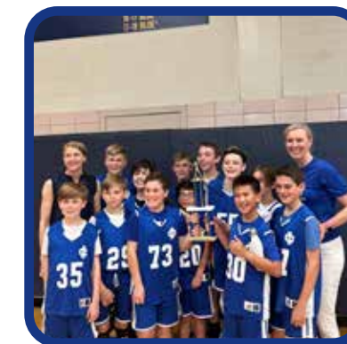
6th Grade Boys Volleyball