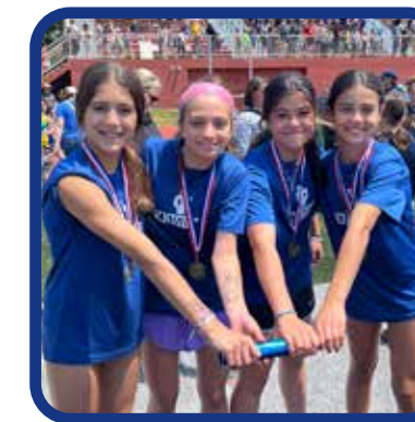
JV Girls Track and Field