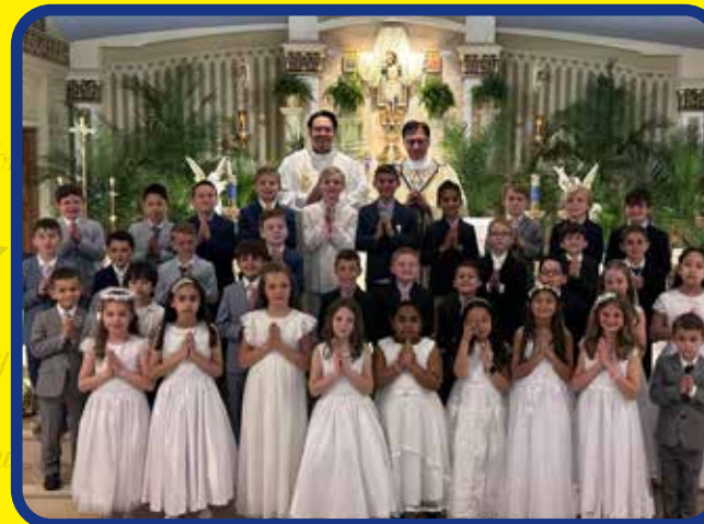
First Holy Communion