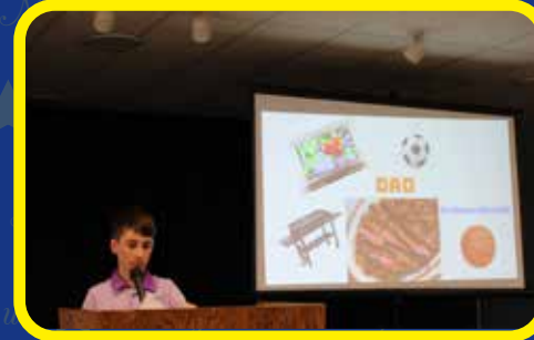
6th Grade Poetry Tea