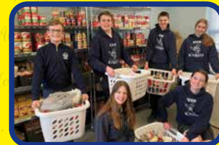
"Souper Bowl" Collection