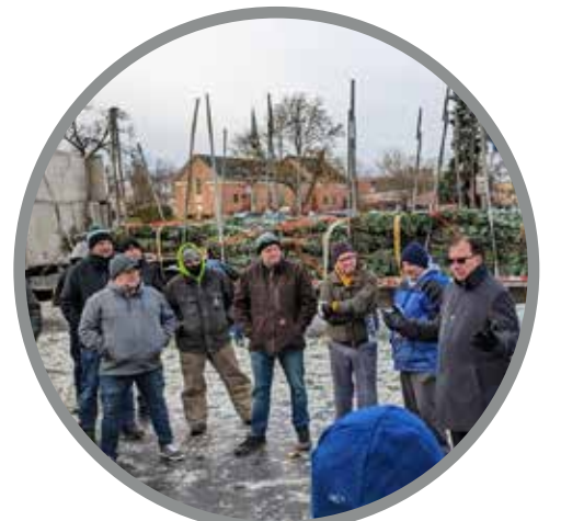
Christmas Tree Lot