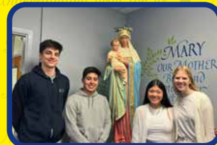
ICCP students (2 alumni) helped our ICGS students every week for their theology class.