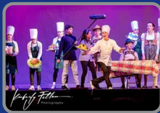
Willy Wonka Jr.

Our HCGS students are encouraged to expand and explore their talents, creativity, and passions outside the classroom and off of the playing field. We offer our students an array of extracurricular activities that allow them to try something new or to grow their interests and talents.