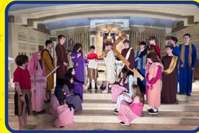
Living Stations of the Cross