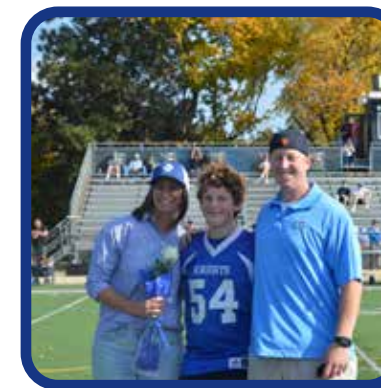
8th Grade Varsity Football