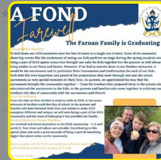
Graduating Family Recognition via Social Media