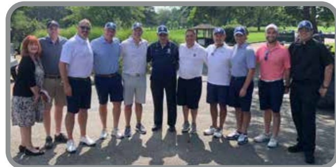
1900 Club Annual Golf Outing