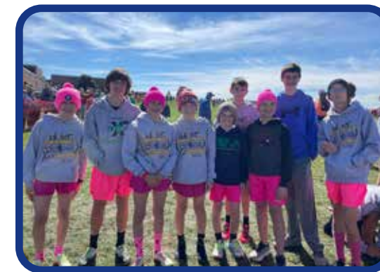
IC/Vis Boys Cross Country 6th Place at State