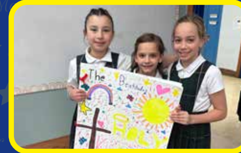
4th Grade Beatitudes Project