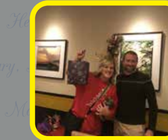
School Board Members at ICGS Faculty and Staff Christmas Party