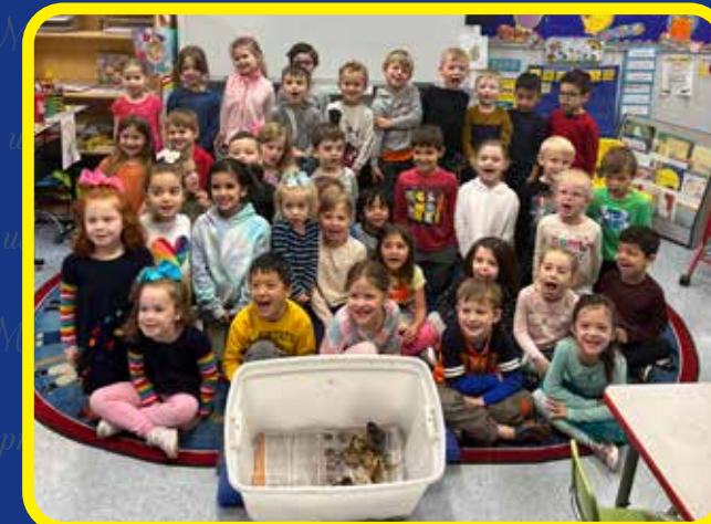
PreK-4 students with the baby chicks they hatched