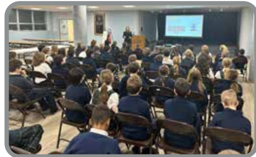
Explore More Days