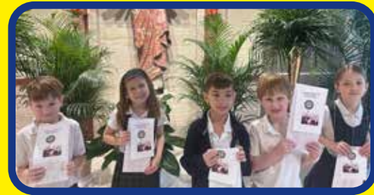
St. Mary's Mission Collection