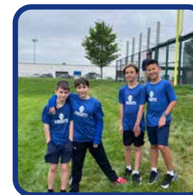
JV Boys Track and Field