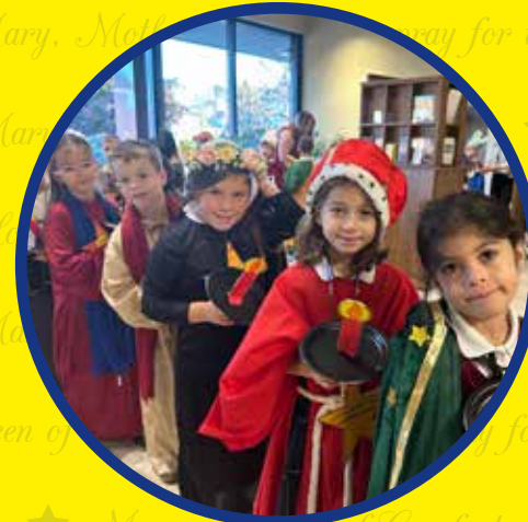
All Saints Day