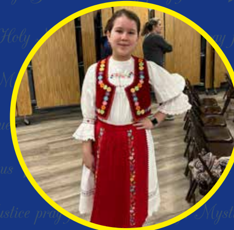
5th Grade Heritage Fair