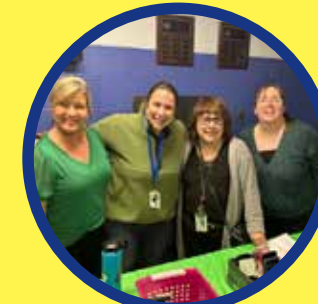
Teachers help out at the Jr. High Dance