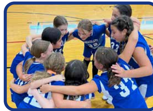
5th Grade Girls Volleyball