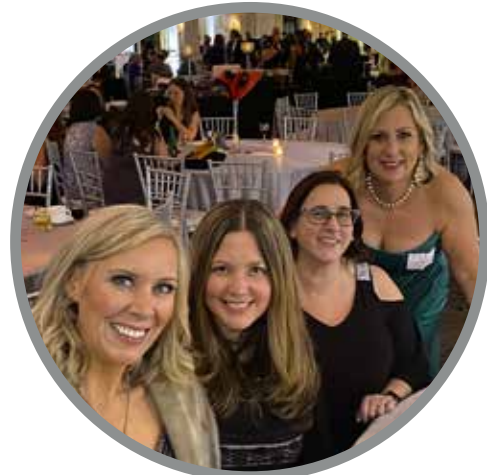
2023 It's Your Lucky Knight Dinner Dance