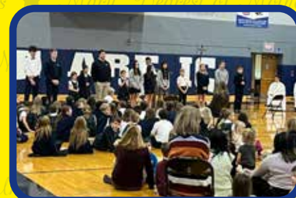
Thanksgiving Prayer Service ICGS and ICCP