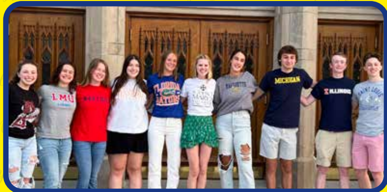
ICGS Class of 2019 College T-shirt Mass

Saint Mary's College Saint Louis University Adrian College Northwestern University Michigan State University University of San Diego Ashland University Milwaukee School of Engineering Loras College DePaul University