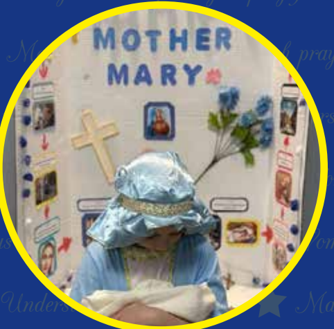
3rd Grade Wax Museum