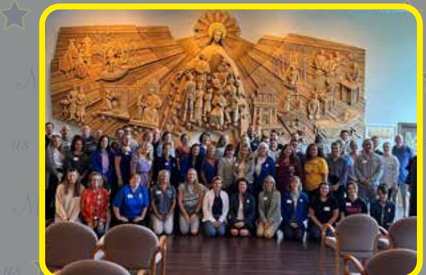
Fall Teacher Retreat ICGS and ICCP