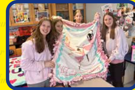
7th Grade Made Blankets for a Shelter