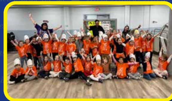
Kindergarten 100 Days Celebration