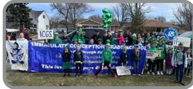
St. Patrick's Day Parade