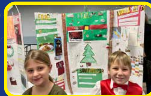
4th Grade Christmas Around the World