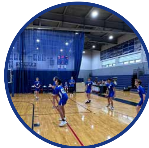
8th Grade Boys Volleyball