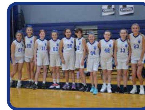
8th Grade Girls Basketball