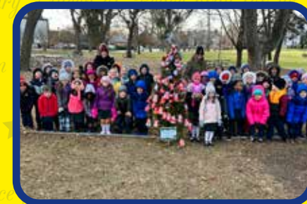
First Grade Christmas Tree at Wilder Park