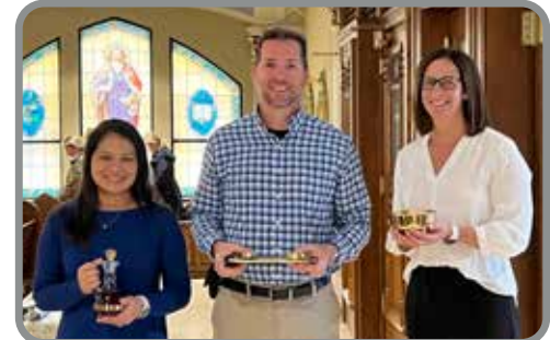
Parent Volunteer Mass