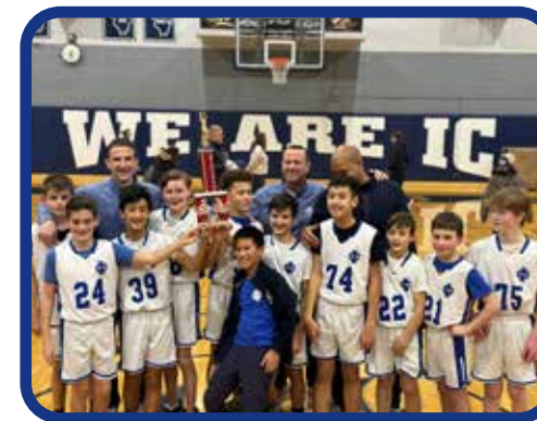
6th Grade Boys Basketball Champions