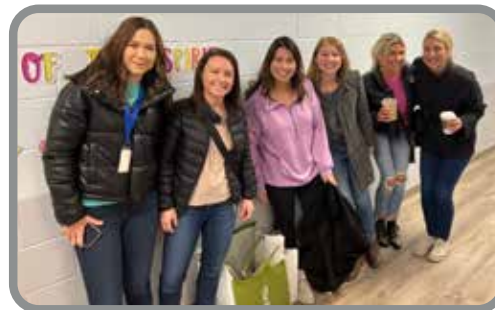
PK4 Room Parents