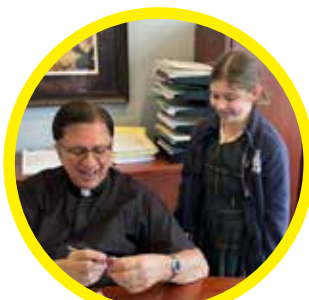
Catholic Schools Week Bingo